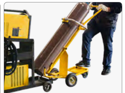
LOAD ONTO CART