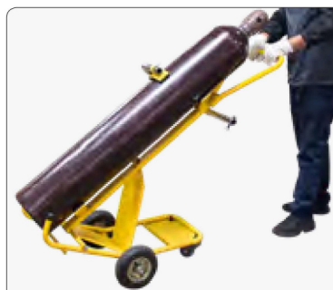
Ready to roll!