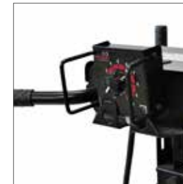
Remote control holder