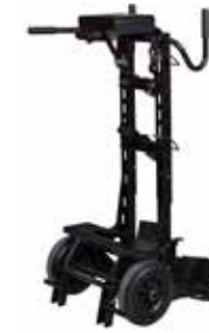
CART 24 K14191-1