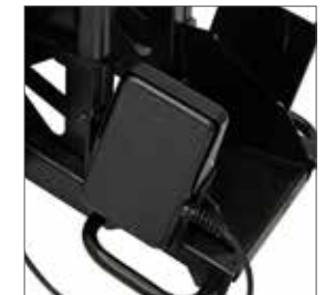
Holder for foot control pedal

Practical handle for effortless gripping even with gloves for safe movement of the machine