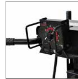
Remote control holder